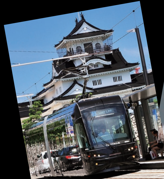
A city of trams A tram lover's paradise with a variety of trams, from traditional to modern LRTs, running throughout the city.