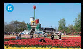
Tonami Tulip Fair Approx. 450 varieties of a million tulips in full bloom from late April to early May