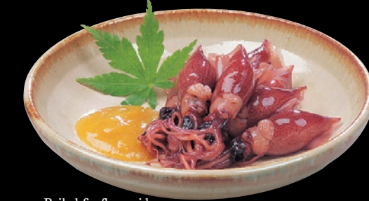
Boiled firefly squid