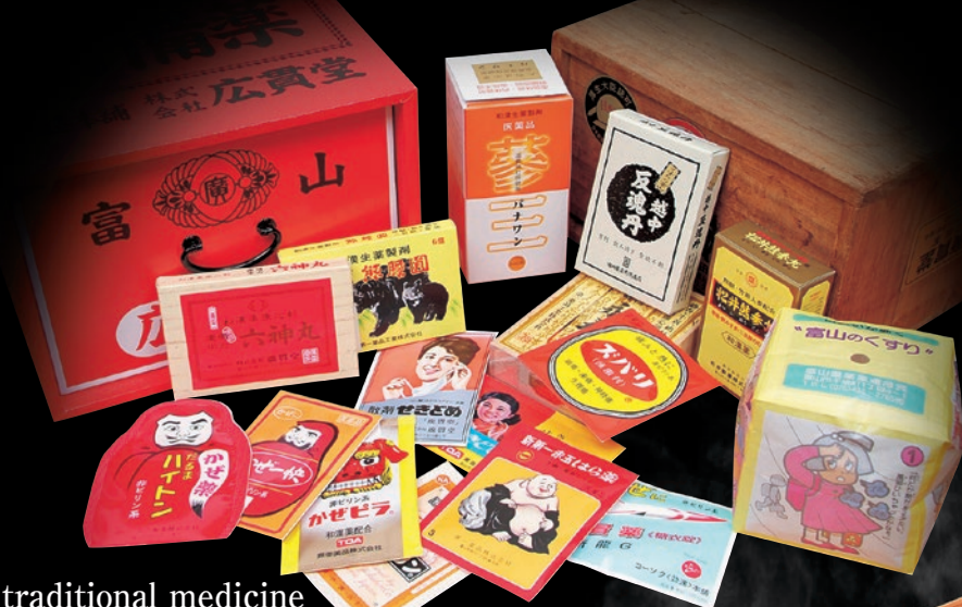
Toyama traditional medicine Toyama traditional medicine is well-known for the home-delivery method employed by medicine peddlers who were active all over Japan from Hokkaido to Okinawa. It is popular not only for its quality but also its retro style packaging.

For inquiries: 076-432-2819 Tateyama Kurobe Kanko Co., Ltd. http://www.alpen-route.com/