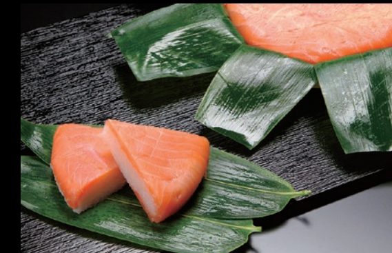
Trout Sushi The beautiful light-pink trout wrapped in bamboo leaves is very appetizing. Each business has its own recipe, so it is a lot of fun comparing the different tastes.