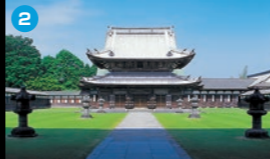
National Treasure Zuiryujii Zen Temple A large zen temple of the Soto Sect, designated as a National Treasure