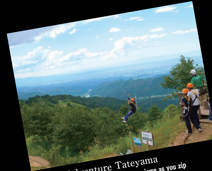
Zipline Adventure Tateyama A new thrilling activity offering great views as you zip through mountain areas on a pulley suspended on a cable.