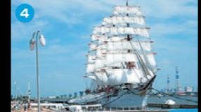
Kaiomaru Park The interior of the ex-sailing ship, Kaiomaru, is exhibited as if it is in service.