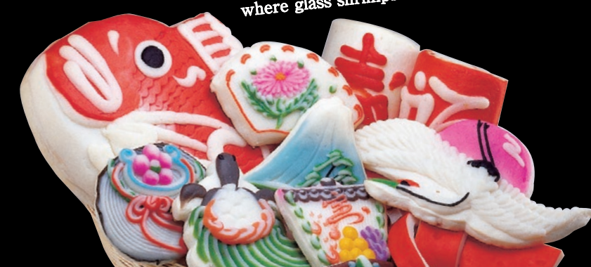
Steamed Fish Paste as a Craft Steamed fish paste in the shape of lucky creatures, such as sea bream, turtles and cranes, are famous in Toyama and very important for special occasions.