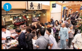
Himi Banyaga-gai Market A tourist facility complex that provides highlights of Himi, such as shopping, hot springs, restaurants and great views