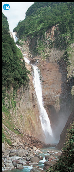
Shomyo Falls The tallest waterfall in Japan with a 350m drop