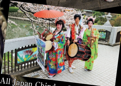
All Japan Chindon Competition Professional Chindon performers from all over Japan compete for a one-million yen prize and the honor of winning in April every year.