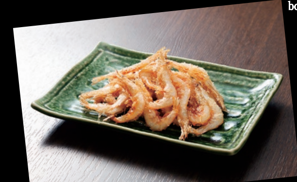
Deep-fried glass shrimp