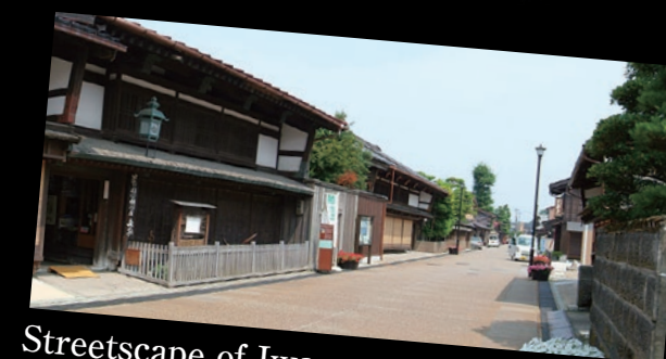
Streetscape of Iwase Once part of Iwase's commercial center, this street now houses various artisans, shops, and the Mori Residence and Masuda Brewery, in carefully preserved and renovated 19th century wooden buildings. The bronze ship sculpture at the north-east end replicates a Kitamaebune, the traditional cargo ship used on the Sea of Japan in the 17th-19th centuries. These ships transported kelp, herring and fertilizers from Hokkaido to other parts of Japan, and brought great wealth and different cultures to Iwase. Across the street is Tajiri, an outstanding sake and wine shop.