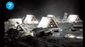
Gokayama Historic Village of Houses with "Praying Hands" Thatched Roofs Houses with "Praying Hands" Thatched Roofs in Suganuma and Ainokura located in a valley where many houses of this style remain