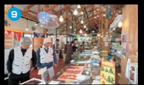
"Ikuji" Fish Market Just landed fresh fish are sold on the spot.