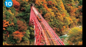
Kurobe Gorge The deepest V-shaped gorge in Japan. Visitors can enjoy the magnificent natural beauty from the trolley train.