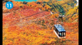
Tateyama Kurobe Alpine Route A world-class mountain climbing route across the Northern Japan Alps, from Toyama City to Shinano-Omachi in Nagano Prefecture.