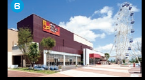
Mitsui Outlet Stores Hokuriku Oyabe The first full-fledged outlet mall in the Hokuriku area