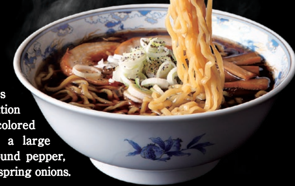
Toyama Black This ramen features an amazing combination of dark-inky black-colored soup, thick noodles, a large amount of coarse ground pepper, and roughly-chopped spring onions.