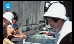
Ikuji's "Shozu (spring water)" Natural springs located along the Kurobe River, which is one of the clearest rivers in Japan