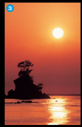
Amaharashi Beach A beach with view of the beautiful Northern Japan Alps